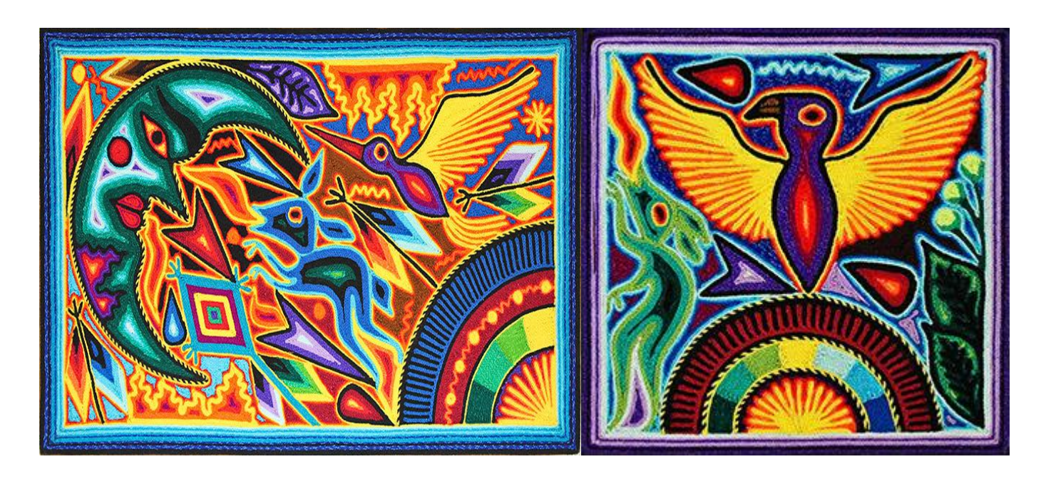
Compared to: Oaxacan-Mexican Alebrijes