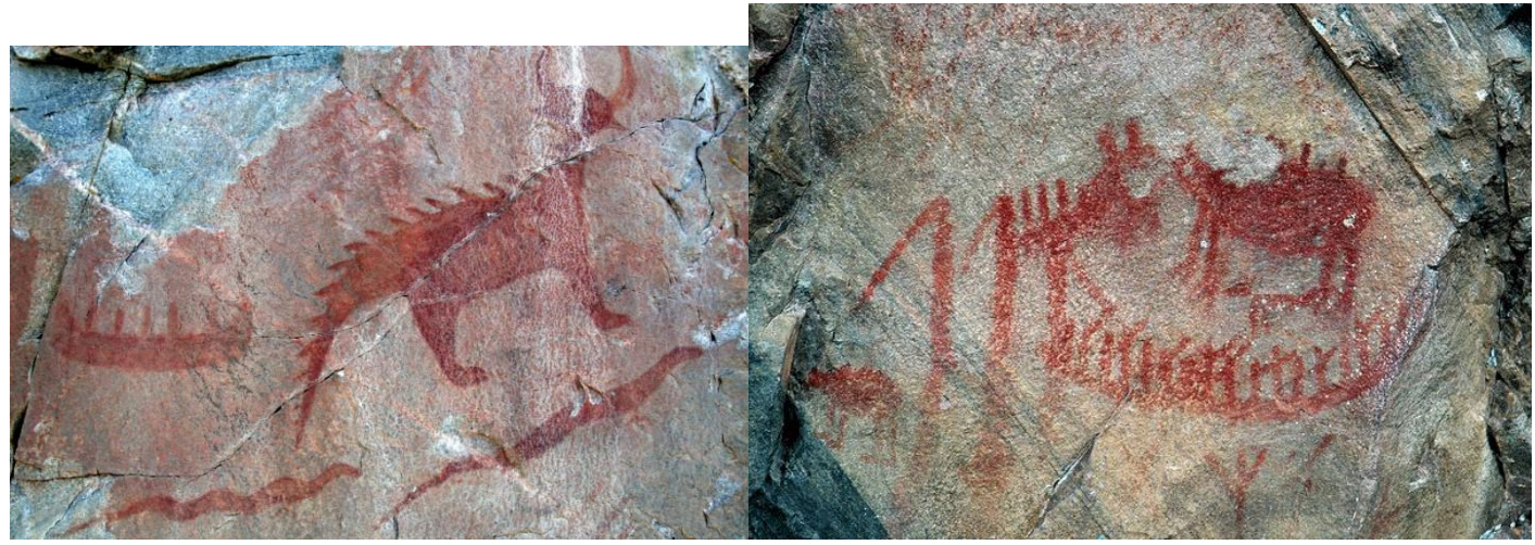
Compared to: Prehistoric Cave Art (Altamira, Lascaux, India)