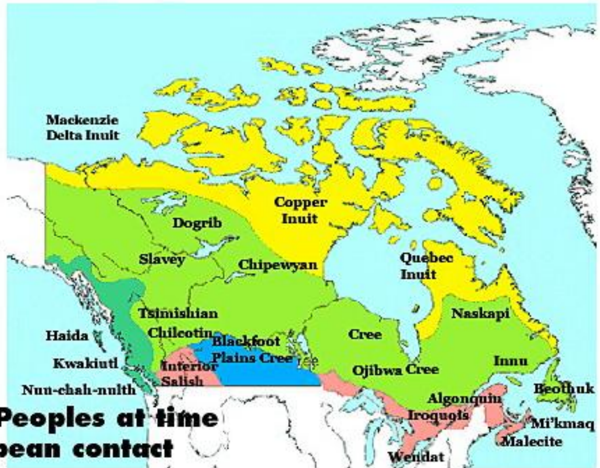
Native Peoples at time of European contact